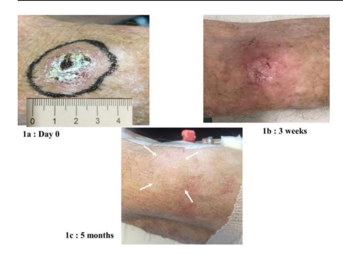
Fig. 2 Temporal evolution of the treated lesion: (a) before treatment; the limits of the PTV are delineated in black; (b) at 3 weeks, at the peak of skin reactions (grade 1 epithelitis NCI-CTCAE v 5.0); (c) at 5 months.

provide comparisons between healthy and irradiated tissue. The fact that this is the first clinical study using FLASH dose rates is also substantial. However, it is limited in that they exclusively analysed the short-term effect of FLASH on cancerous skin tissue alone; the effect that electron FLASH would have on other organs of different tissue depths and morphologies based on this data is unknown. Regardless, this result bodes well for further clinical translation, as limiting inflammation is still greatly beneficial for patients experiencing radiation induced skin complications. Further translation clearly requires additional indications to display the benefits of this treatment modality, (e.g., irradiation of brain, lung, or liver tumours) would represent more complicated anatomy where improvement in outcomes is needed. Additionally, there were no conventional dose rate irradiations conducted within this study to directly compare the FLASH treatment to; all irradiations were FLASH only [34].