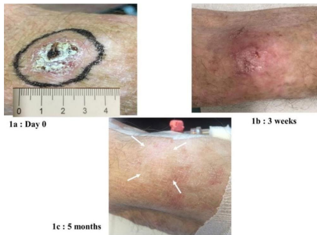
Fig. 2 Temporal evolution of the treated lesion: (a) before treatment; the limits of the PTV are delineated in black; (b) at 3 weeks, at the peak of skin reactions (grade 1 epithelitis NCI-CTCAE v 5.0); (c) at 5 months.

provide comparisons between healthy and irradiated tissue. The fact that this is the first clinical study using FLASH dose rates is also substantial. However, it is limited in that they exclusively analysed the short-term effect of FLASH on cancerous skin tissue alone; the effect that electron FLASH would have on other organs of different tissue depths and morphologies based on this data is unknown. Regardless, this result bodes well for further clinical translation, as limiting inflammation is still greatly beneficial for patients experiencing radiation induced skin complications. Further translation clearly requires additional indications to display the benefits of this treatment modality, (e.g., irradiation of brain, lung, or liver tumours) would represent more complicated anatomy where improvement in outcomes is needed. Additionally, there were no conventional dose rate irradiations conducted within this study to directly compare the FLASH treatment to; all irradiations were FLASH only [34].